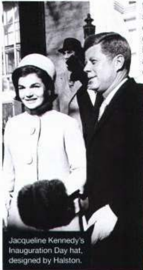
Jacqueline Kennedy's Inauguration Day hat, designed by Halston.