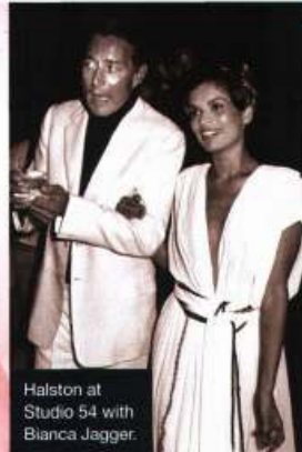
Halston at Studio 54 with Bianca Jagger.