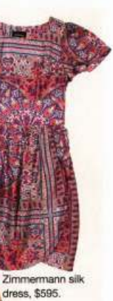
Zimmermann silk dress, $595.