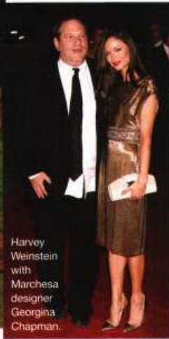
Harvey Weinstein with Marchesa designer Georgina Chapman.