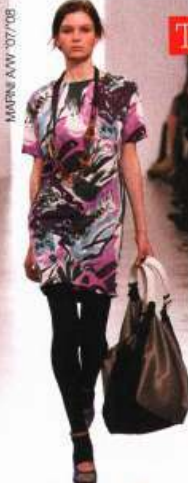
MARCS NY '07/08

If you can't commit eternal love to an It bag this season, why not log onto www.lovemeandleaveme.com to hire (rather than buy) your pick of the moment.