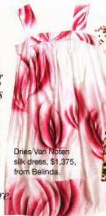
Dries Van Noten silk dress, $1,375, from Belinda.

With painterly dresses flooding winter runways overseas, we're seeing a deluge of pretty prints and sweet little Impressionist numbers in store.