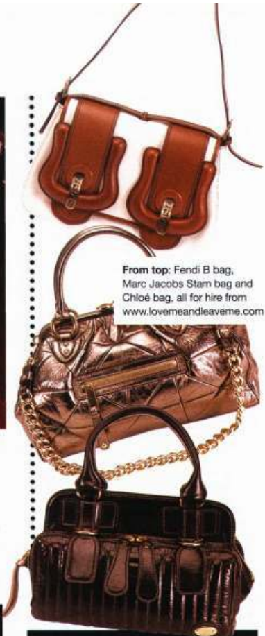
From top: Fendi B bag, Marc Jacobs Stam bag and Chloé bag, all for hire from www.lovemeandleaveme.com