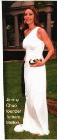
Jimmy Choo founder Tamara Mellon