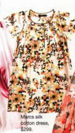
Marc's silk cotton dress, $299.