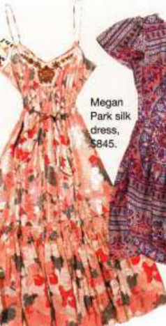
Megan Park silk dress, $845.