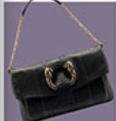
BELGIAN LEOPARD COLLECTION WALKER BAG IN ANTHRACITE MATE PITCHER SKIN $4750