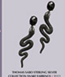
THOMAS MAO STEELING WORK COLLECTION VIVANT EARRINGS J.3171