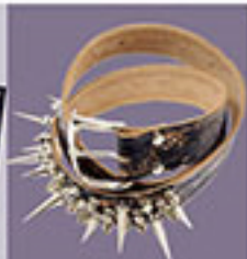
WOMEN WISDOMS-BELT LNU, Frenchling