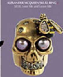
ALEXANDER MCQUEEN WALKER BING J.316, Louis Vuitton and Louis Vuit